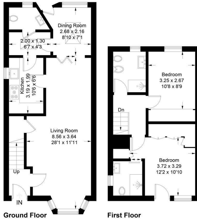
Illustration for identification purposes only, measurements are approximate, not to scale. Fourlabs.co © (ID1257022)

Approximate Gross Internal Area = 88.7 sq m / 955 sq ft